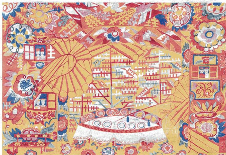
Grand designs Natalia Goncharova's design for the stage backdrop for Diaghilev's 'Le Coq d'Or' (1919)