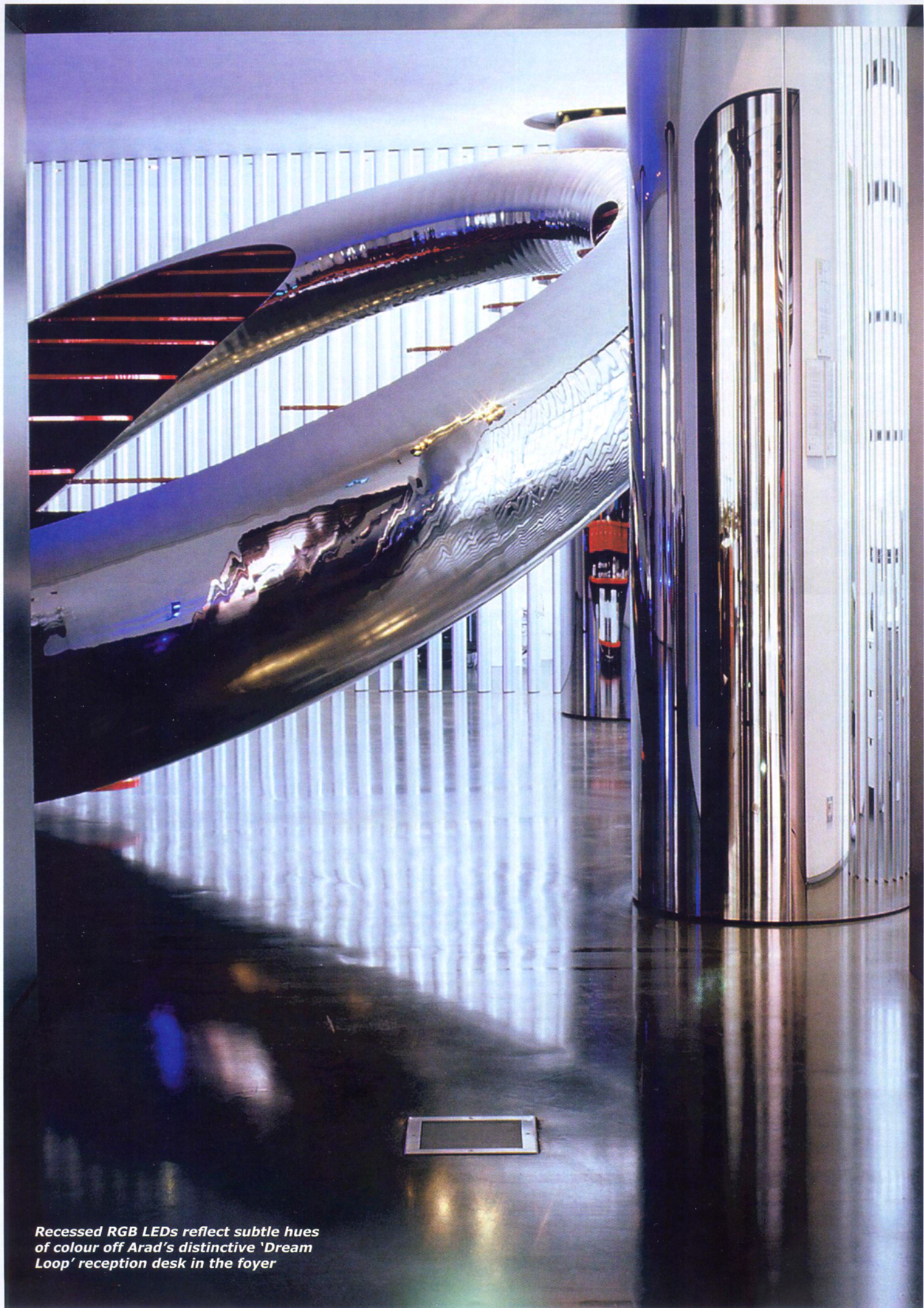
Recessed RGB LEDs reflect subtle hues of colour off Arad's distinctive 'Dream Loop' reception desk in the foyer